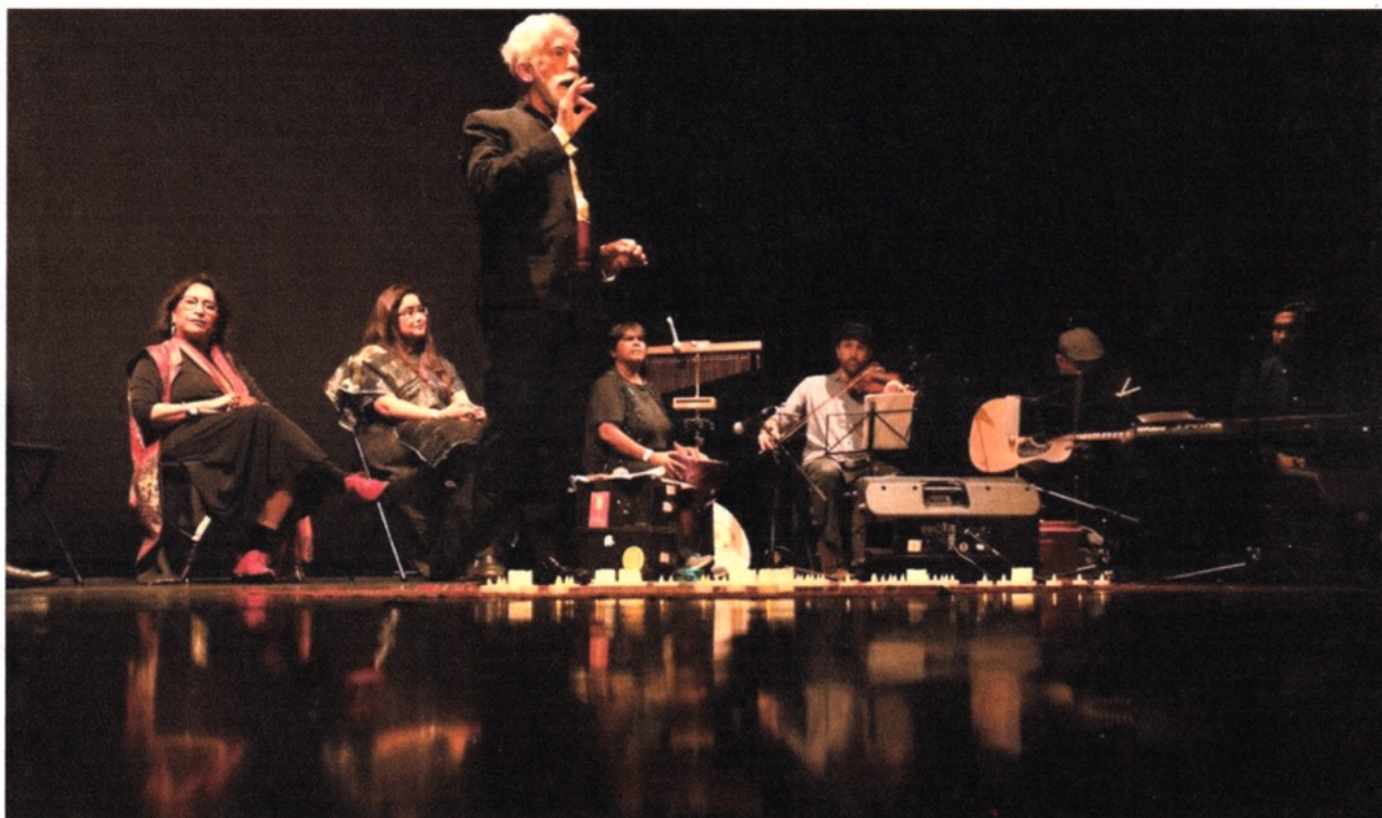
East at A Season of Bangla Drama, 2024.